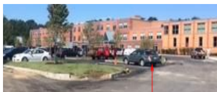
To park- enter at 2 nd /middle entrance to lot