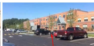
Visitor Parking- 1 st Row